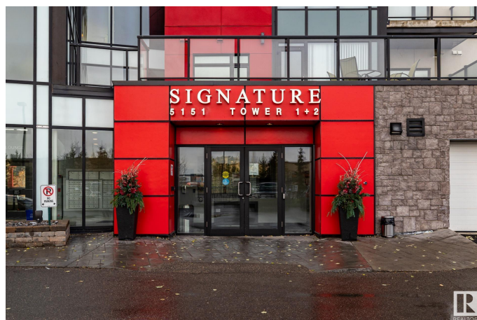
1121-5151 Windermere Blvd, Edmonton, AB