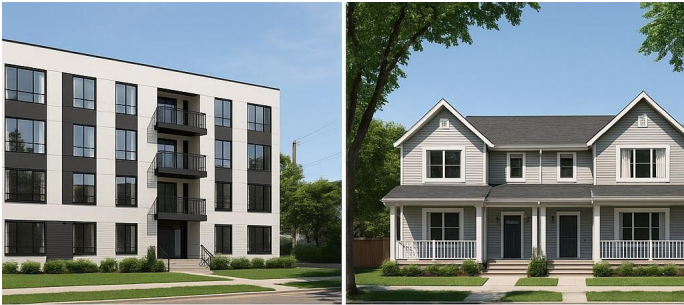
24-SUITE CONDO SIDE-BY-SIDE DUPLI