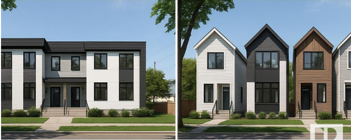
4-PLEX SKINNY HOMES