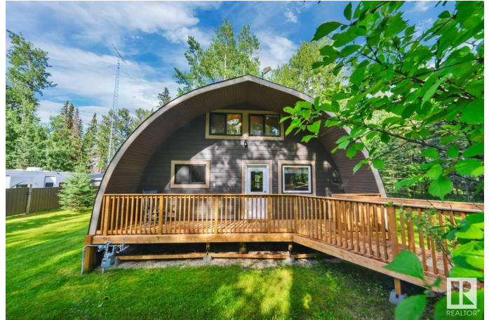
77 Township Rd 462A, Wetaskiwin County, AB